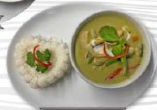
KANG KEAW WAN