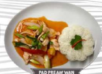
PAD PRAW WAN