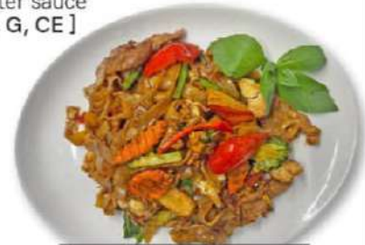
GUAY TIEW KEE MOW

Chicken / Beef / Pork / Vegetables Stir fried with onion, bell pepper, carrot, spring onions, mushrooms and oyster sauce [ F, MO, G, CE ]