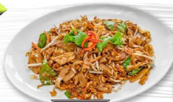
PAD SI EW