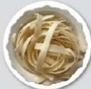
Flat Rice Noodle