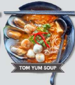
TOM YUM SOUP